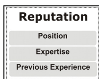
Figure 2: Reputation module.

Taking all these factors into account we have defined an own “concept of reputation” (see Figure 2).