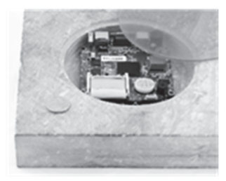
Figure 1: Component of the Intelligent Pavement (before installation of connections and covering) Model 2010.

The IPavement is unusual in that it contains within it elements that are not typical of conventional paving (electrical, electronic, radio frequency, etc.) (see Figure 1), which means that in addition to carrying out its conventional function it fulfils a second function, which is to support the intelligent city's service infrastructures.